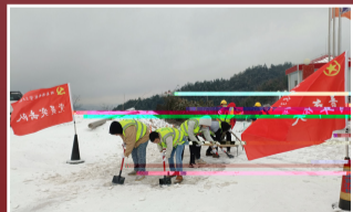
11 30 3A